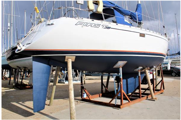
Beneteau First 38