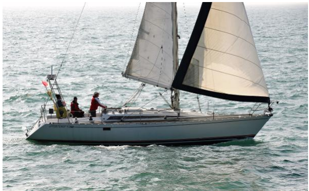
Beneteau First 38