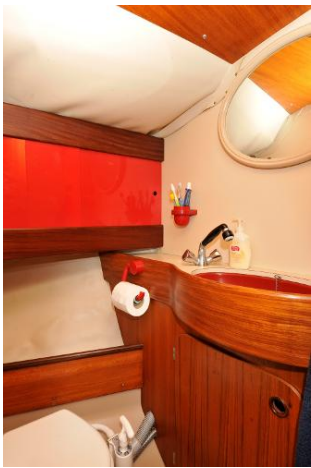
Beneteau First 38