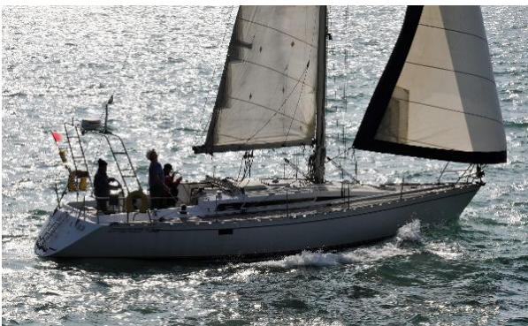
Beneteau First 38