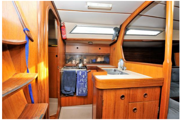
Beneteau First 38