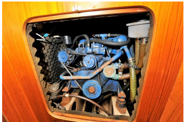
Beneteau First 38