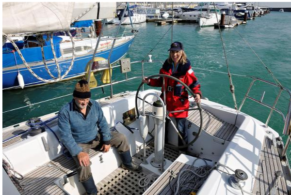
Beneteau First 38