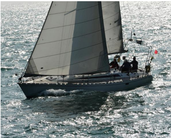
Beneteau First 38