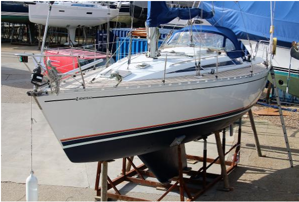
Beneteau First 38