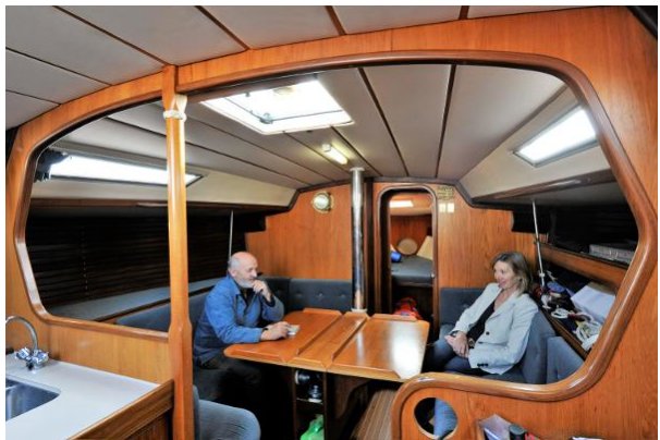
Beneteau First 38