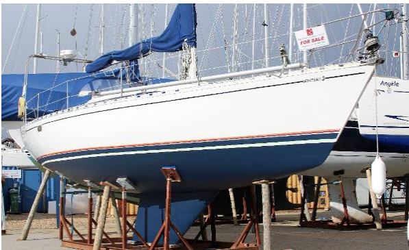
Beneteau First 38