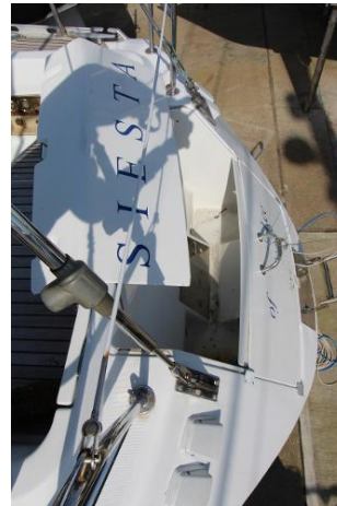
Beneteau First 38