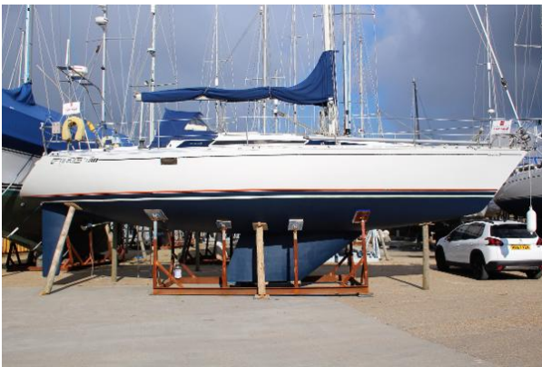
Beneteau First 38