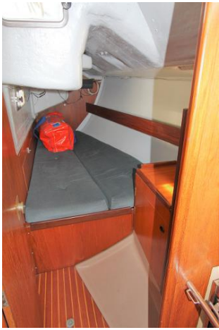
Beneteau First 38