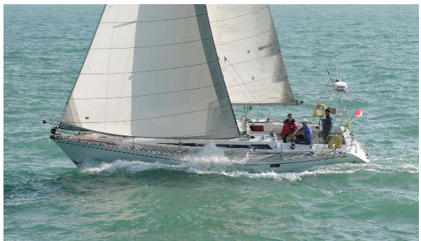
Beneteau First 38