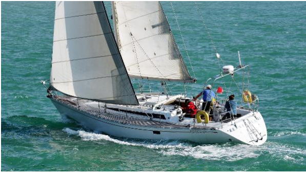
Beneteau First 38