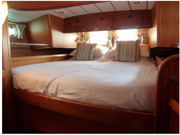
Najad 441 "Alkira"