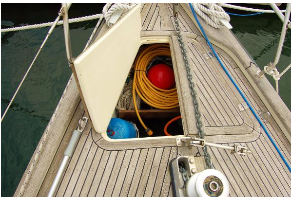
Najad 441 "Alkira"