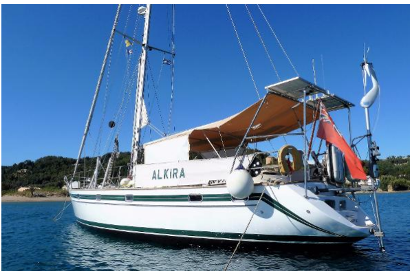
Najad 441 "Alkira"