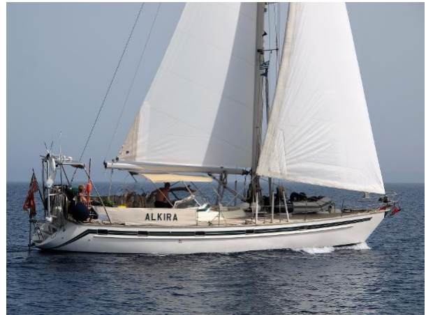
Najad 441 "Alkira"