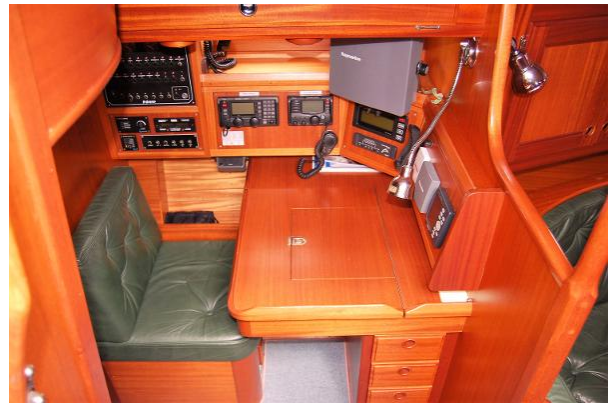
Najad 441 "Alkira"