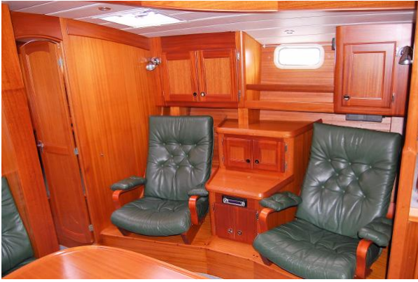
Najad 441 "Alkira"