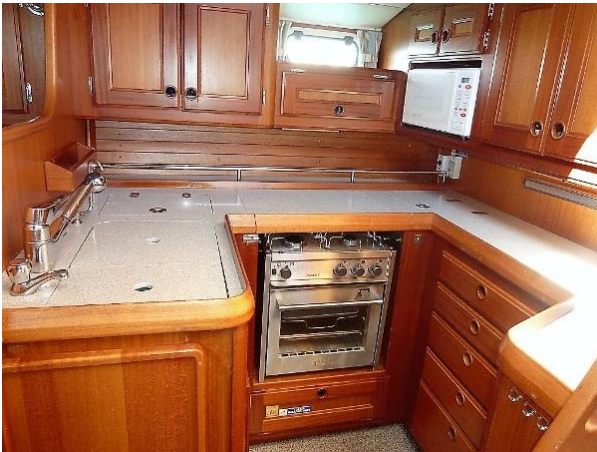
Najad 441 "Alkira"