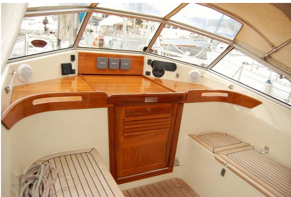
Najad 441 "Alkira"