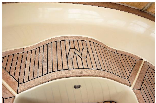
Najad 441 "Alkira"