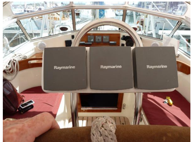
Najad 441 "Alkira"