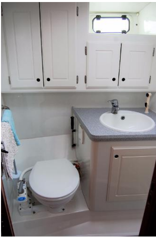
Najad 441 "Alkira"