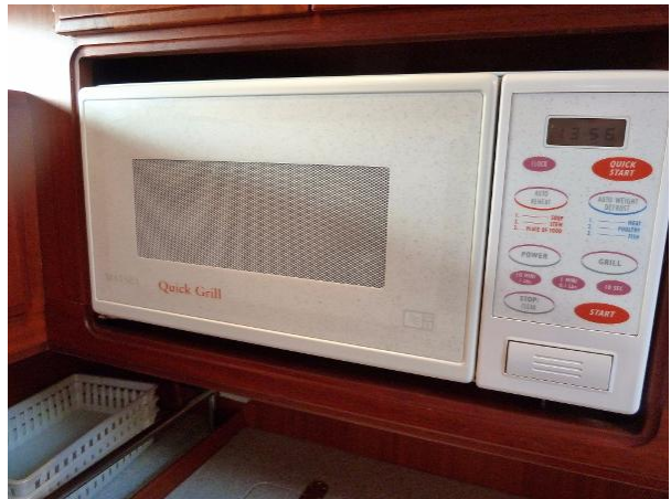
Najad 441 "Alkira"