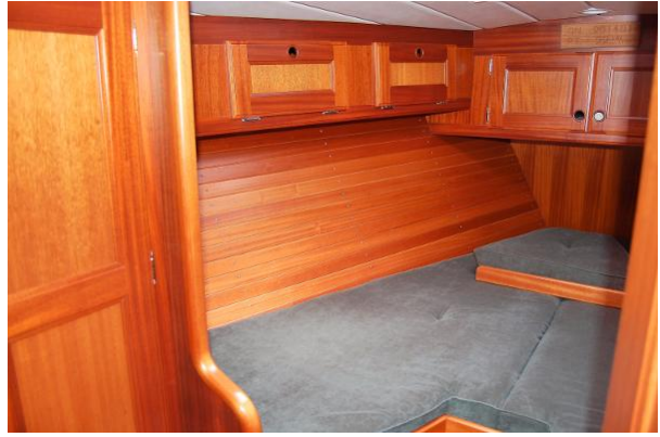
Najad 441 "Alkira"