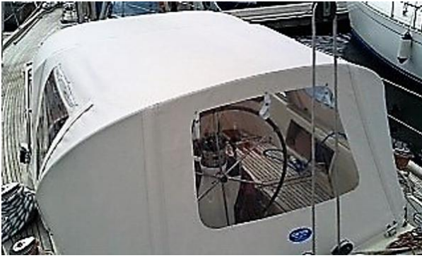
Najad 441 "Alkira"