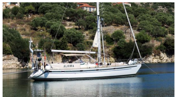
Najad 441 "Alkira"