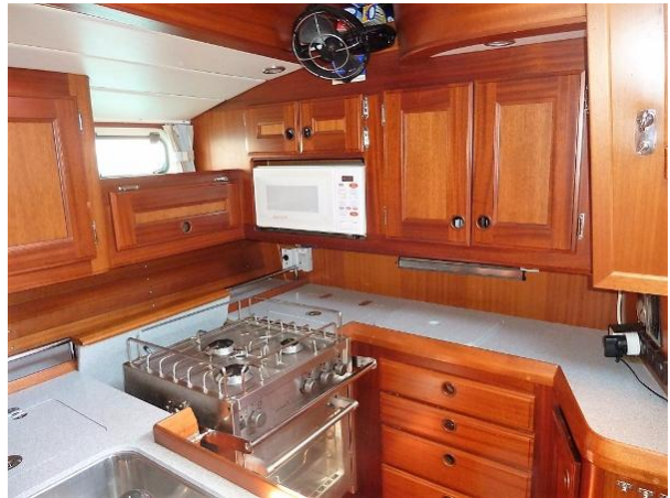
Najad 441 "Alkira"