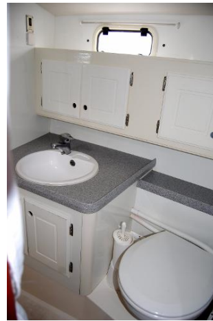
Najad 441 "Alkira"