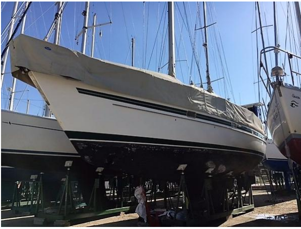
Najad 441 "Alkira"