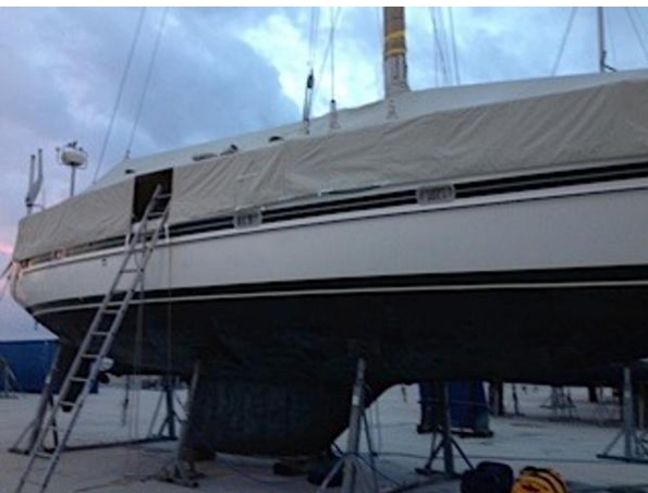
Najad 441 "Alkira"