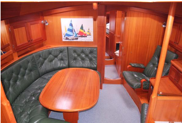
Najad 441 "Alkira"