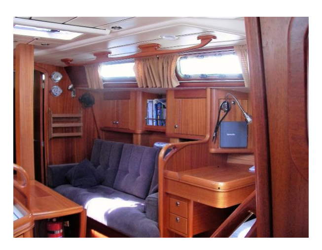
2002 Najad 373 Starboard saloon