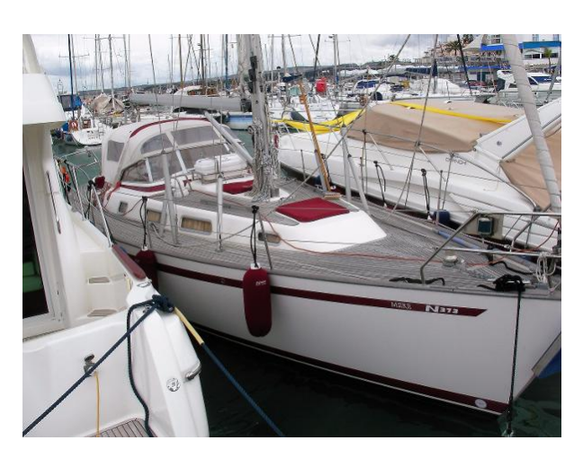
2002 Najad 373 Foredeck