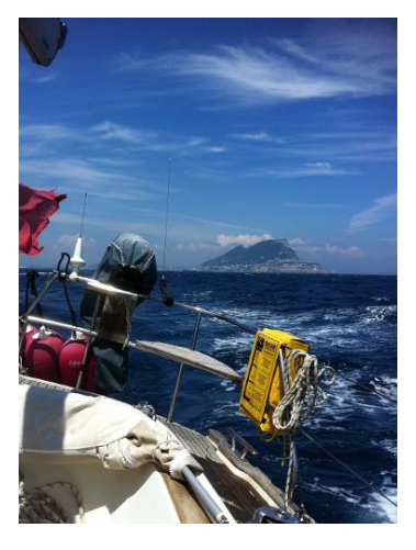
2002 Najad 373 Fast and safe sailing!