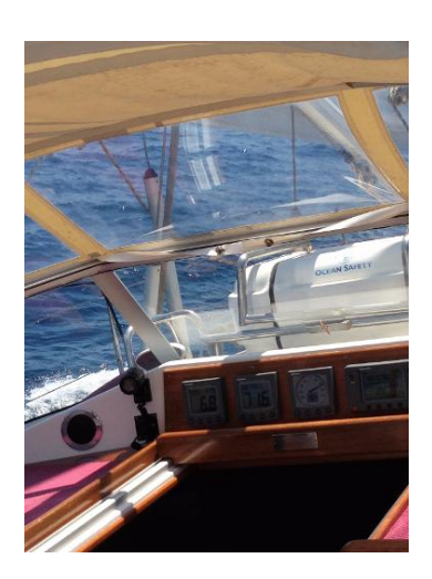
2002 Najad 373 - ST 60 intstruments