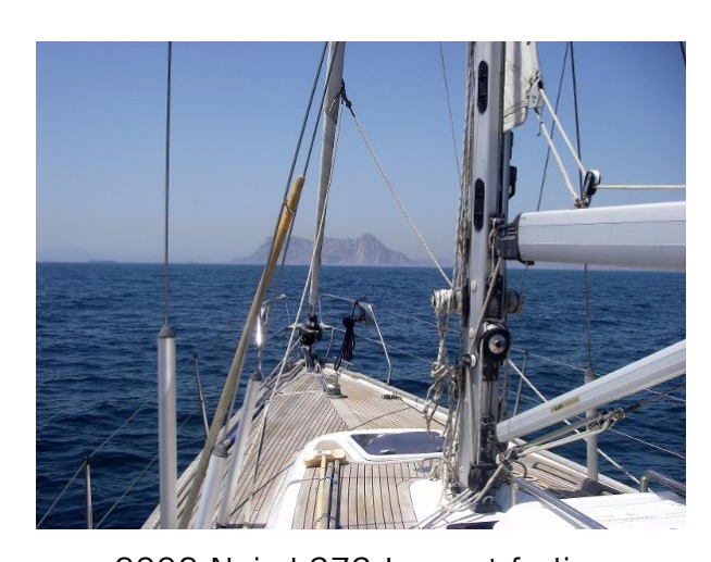
2002 Najad 373 In-mast furling