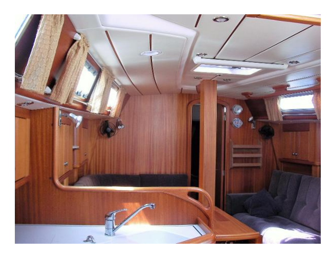
2002 Najad 373 Saloon