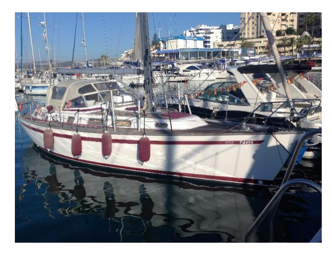
2002 Najad 373 Starboard bow