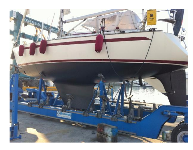
2002 Najad 373 out of the water