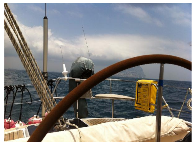
2002 Najad 373 seat on pushpit