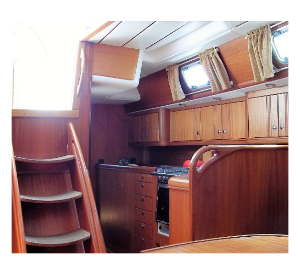
2002 Najad 373 Galley