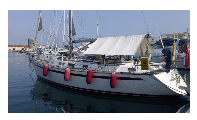
2002 Najad 373 - Port Quarter