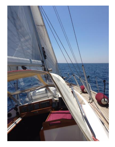
2002 Najad 373