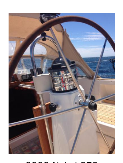
2002 Najad 373