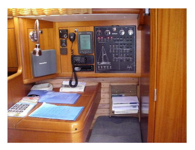
2002 Najad 373 Chart table