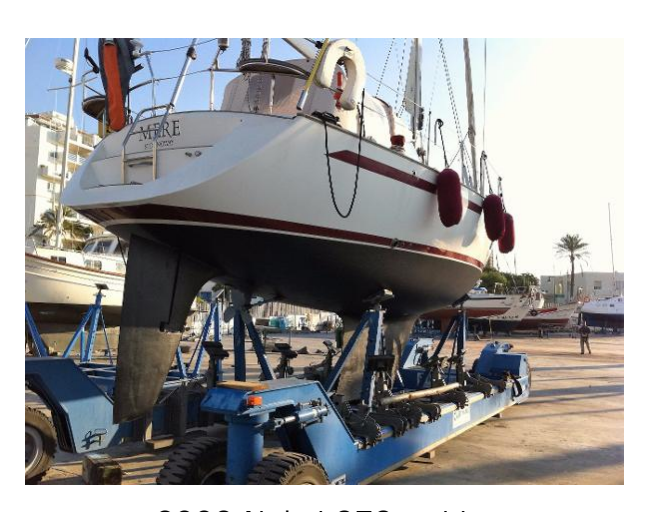
2002 Najad 373 rudder