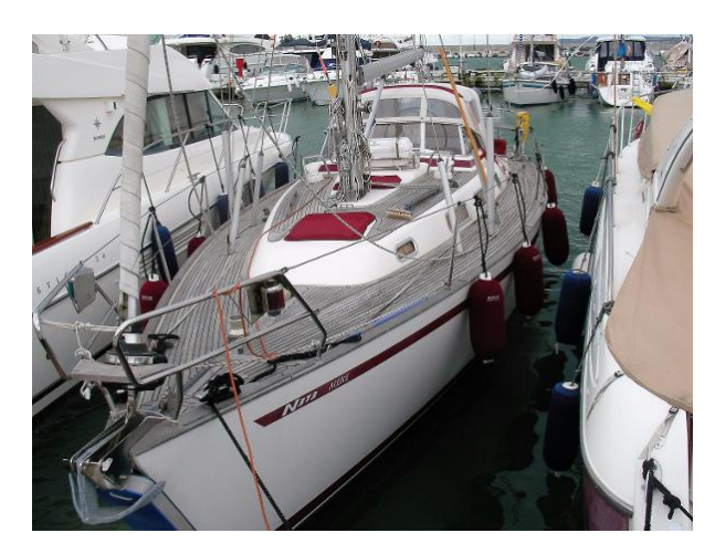
2002 Najad 373 Port bow