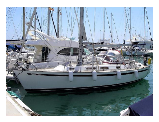
2002 Najad 373 - Port side