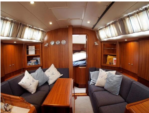
Najad 355 Saloon